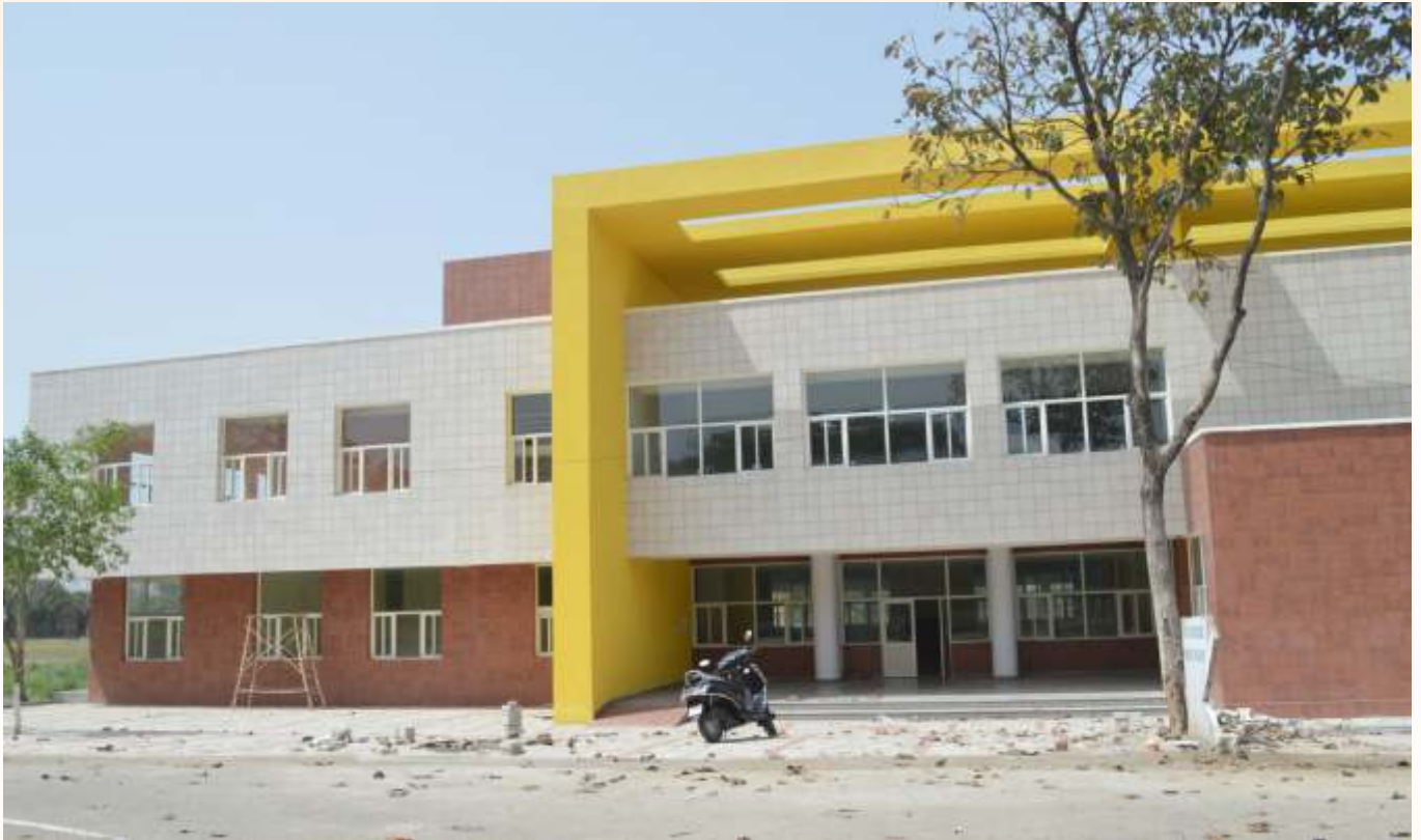
Sport Complex & Swimming Pool