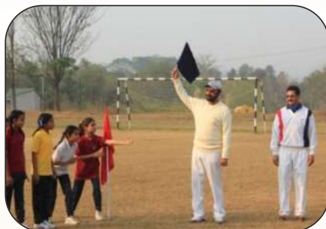
*Director flags off Inter-House Cross Country*